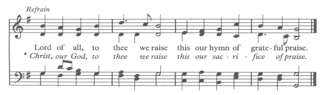
*For Holy Communion