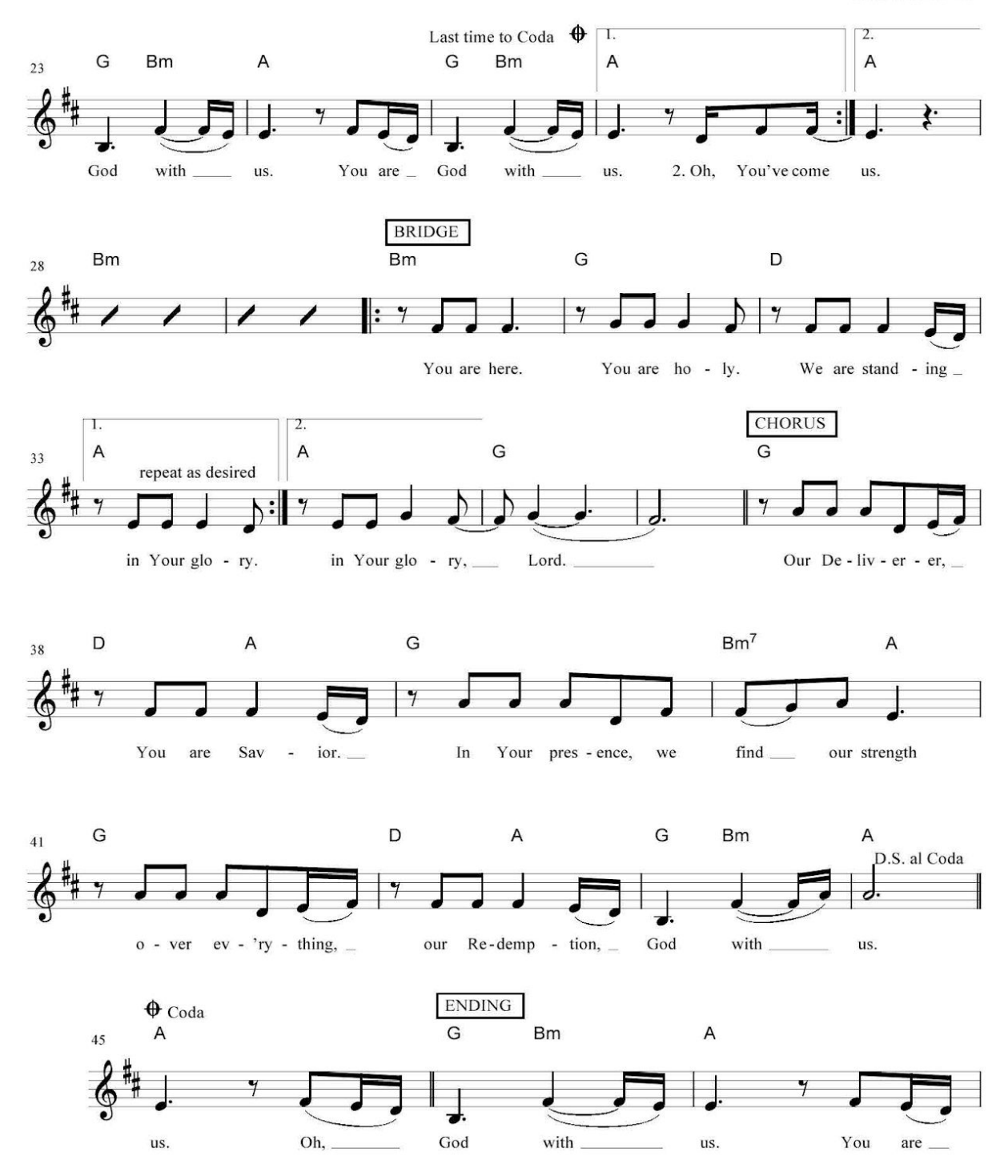
God With Us - 2